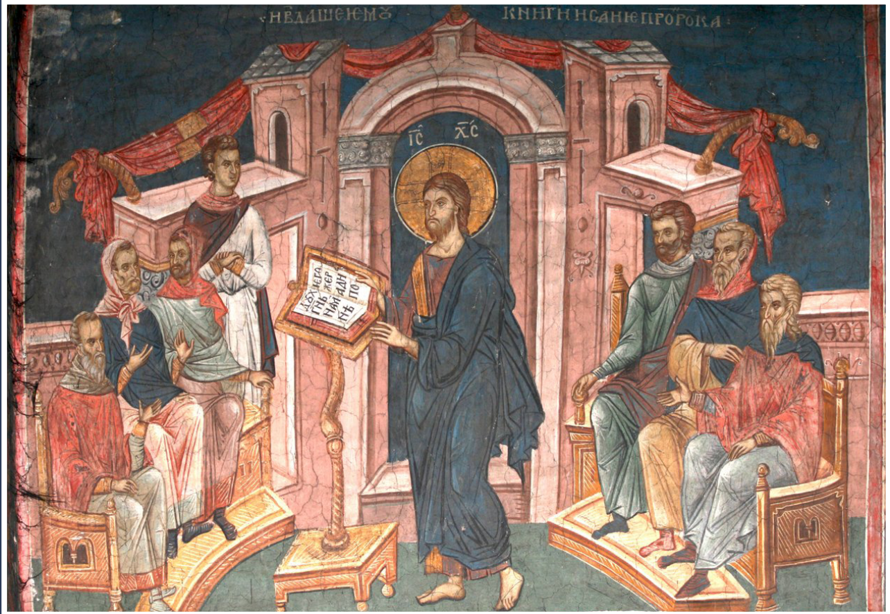
Christ in the Synagogue of Nazareth | Unknown | c. 1350

January 26, 2025 | Third Sunday in Ordinary Time