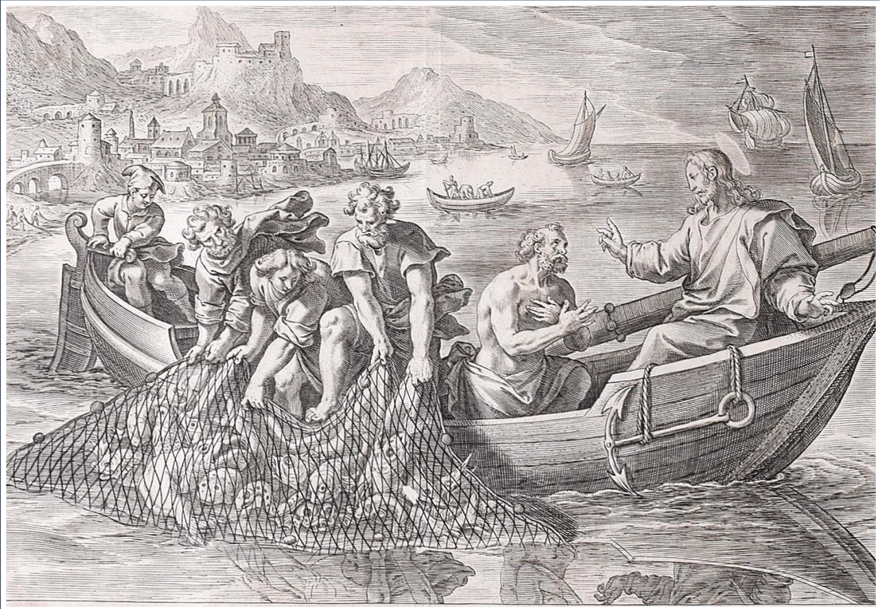
Miraculous Catch of Fish | Adriaen Collaert | c. 1560-1618

February 9, 2025 | Fifth Sunday in Ordinary Time