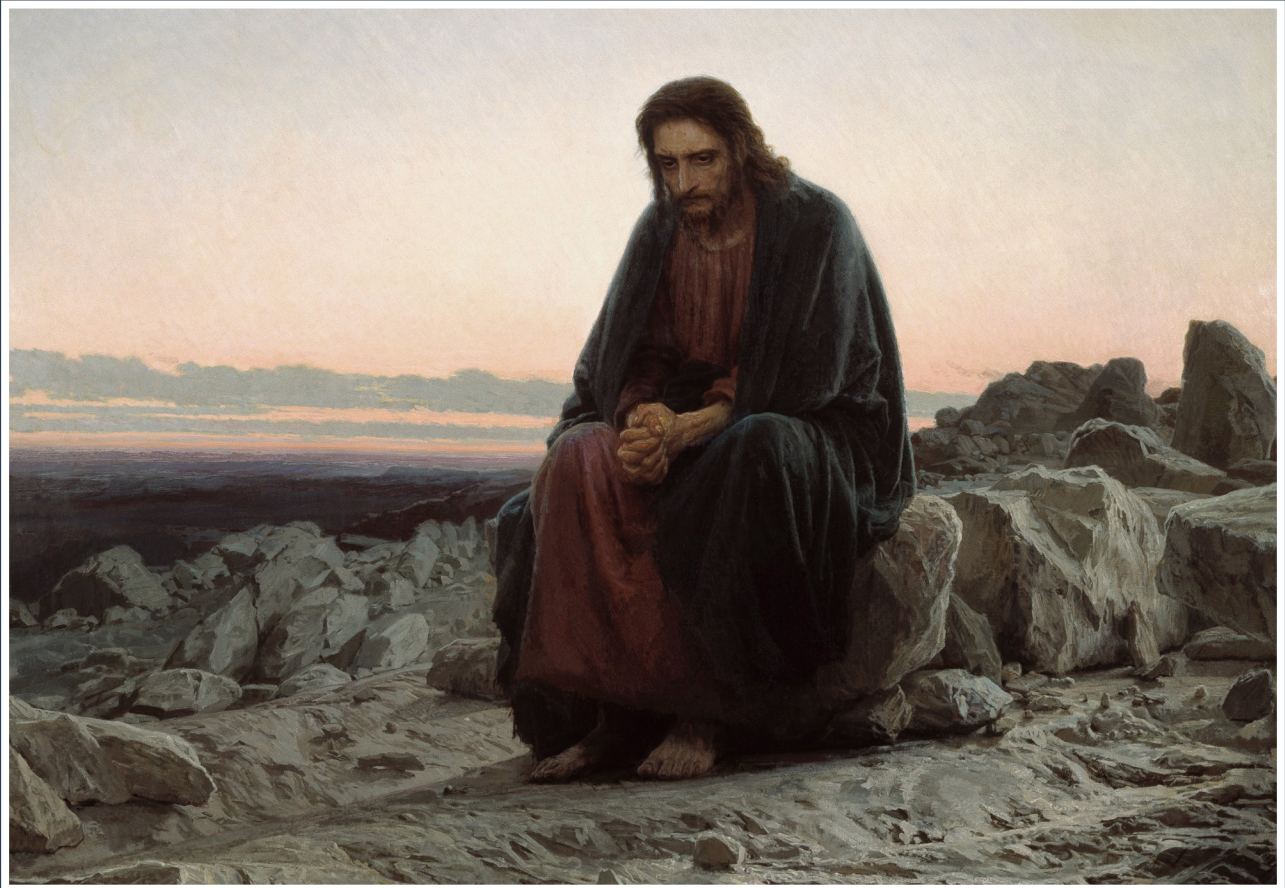
Christ in the Desert | Ivan Kramskoi | 1872

February 18, 2024 | First Sunday of Lent