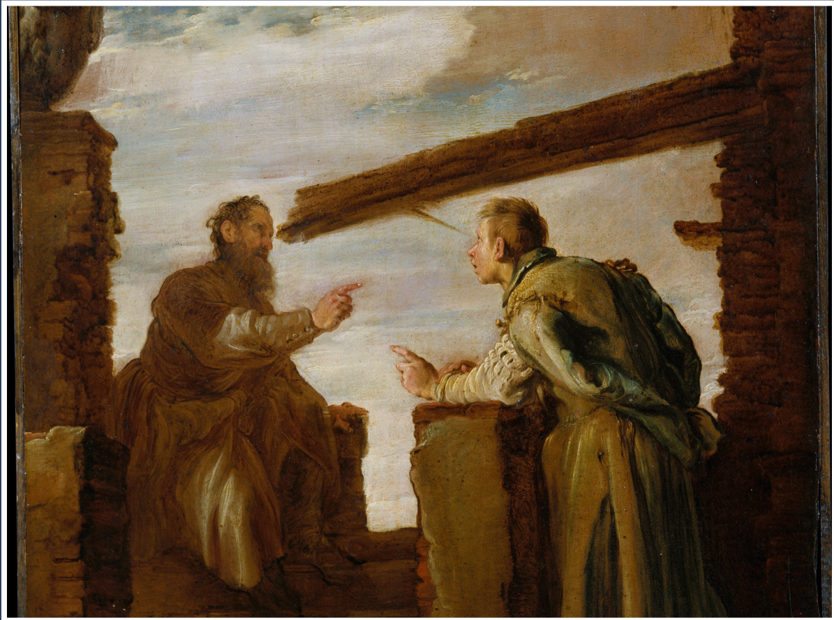
The Parable of the Mote and the Beam | Domenico Fetti | c. 1619

March 2, 2025 | Eighth Sunday in Ordinary Time