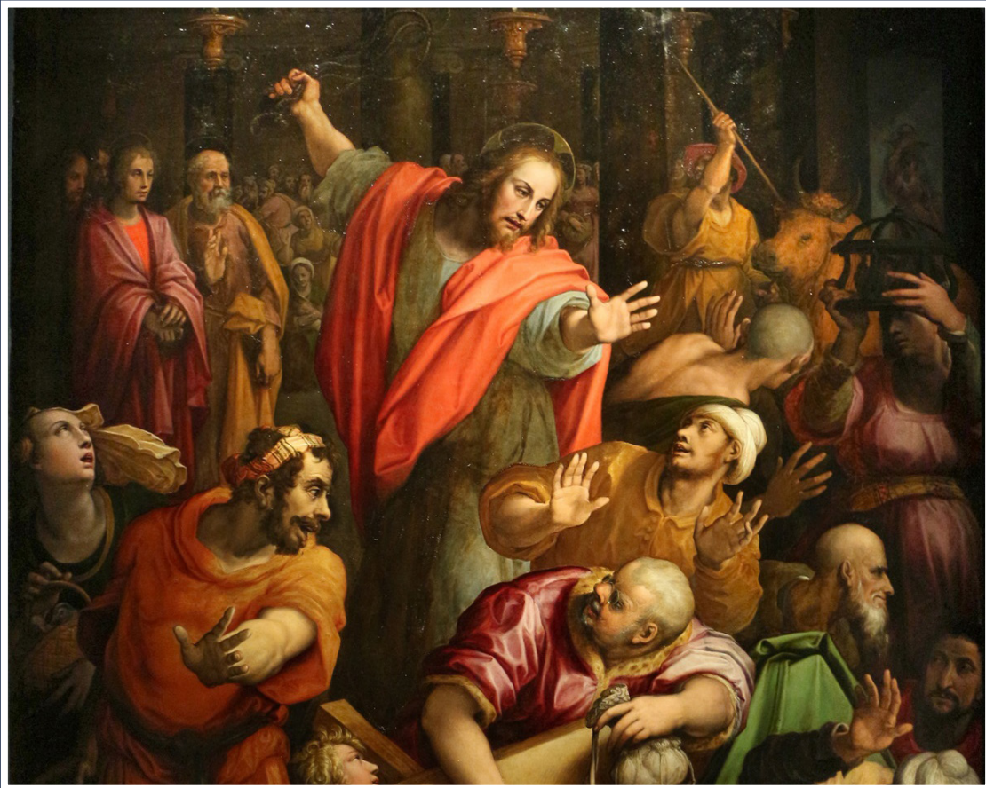
Christ Driving the Money-Changers from the Temple | Johannes Stradanus | 1572