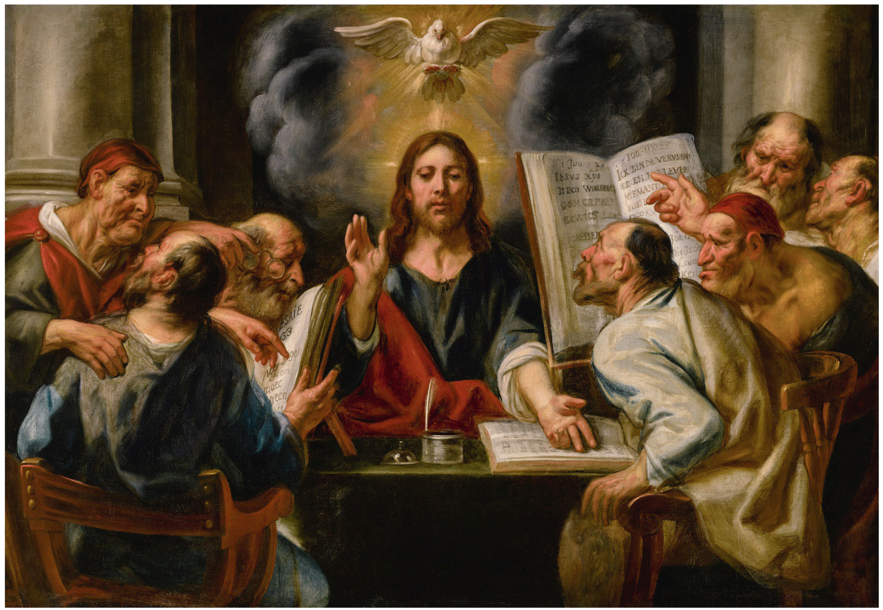
Christ among the Pharisees | Jacob Jordaens | c. 1660 - 1670

October 29, 2023 | Thirtieth Sunday in Ordinary Time