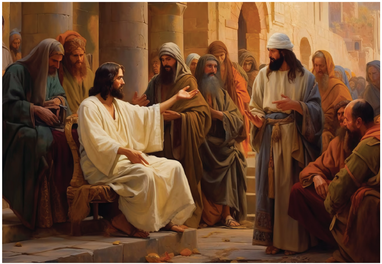
Pharisees in the Temple | Robert Arts Gallery | c. Unknown

November 5, 2023 | Thirty-first Sunday in Ordinary Time