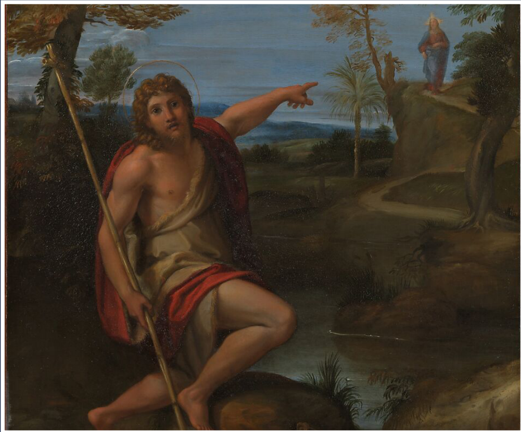
Saint John the Baptist Bearing Witness | Annibale Carracci | c. 1600

December 8, 2024 | Second Sunday of Advent