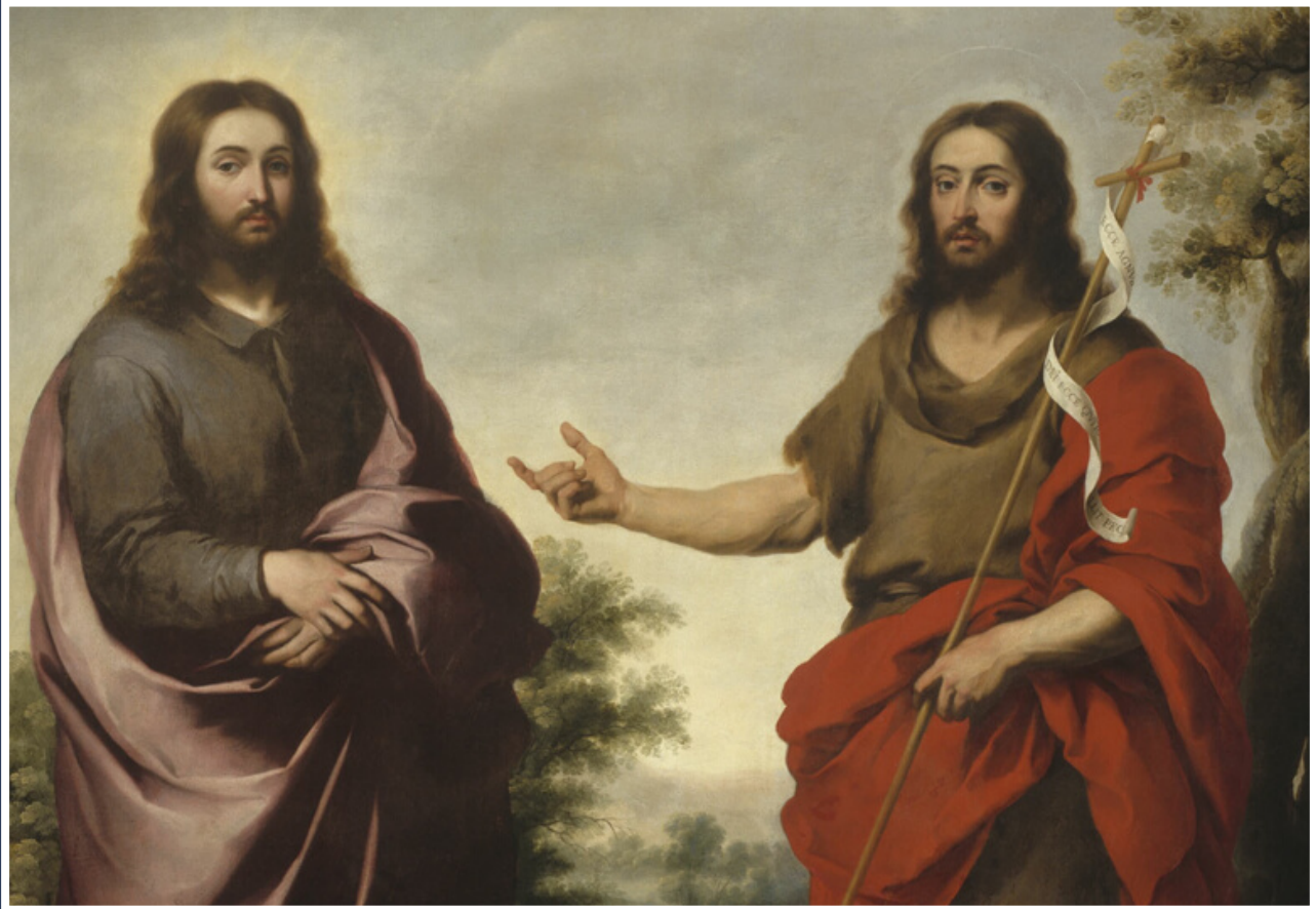
Ecce Angulus Dei | Bartolomé Estéban Murillo | c. 1655

December 15, 2024 | Third Sunday of Advent