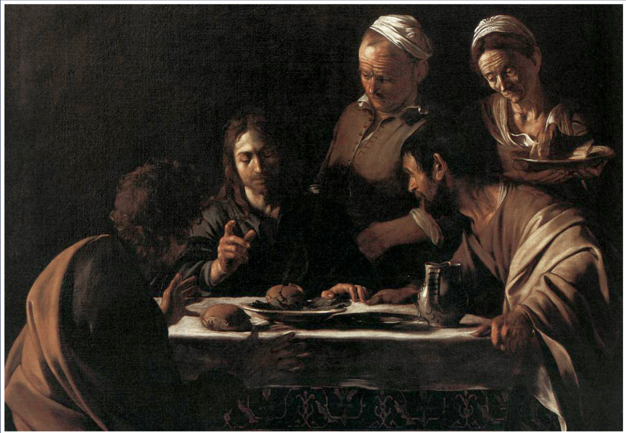
Supper at Emmaus | Caravaggio | c. 1606