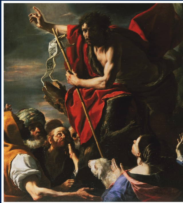
Saint John the Baptist, Preaching | Mattia Preti | c 1665

December 4, 2022 | Second Sunday of Advent